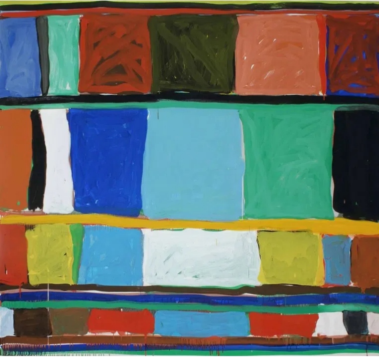
STANLEY WHITNEY, "Out into the Open," 1992 (unframed, acrylic on canvas, 53.5 × 60 inches). | Saint Louis Art Museum, The Thelma and Bert Ollie Memorial Collection. E14521.79 © Stanley Whitney