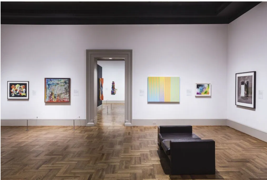
Installation view of "The Shape of Abstraction: Selections From the Ollie Collection" at the Saint Louis Art Museum.

AS JAMES LITTLE NOTED EARLIER, Ollie's penchant for abstract art was rare. When he began buying, African American collectors primarily sought representational images that directly explored black subjectivity and the black experience through figuration, which is what most black artists were producing.