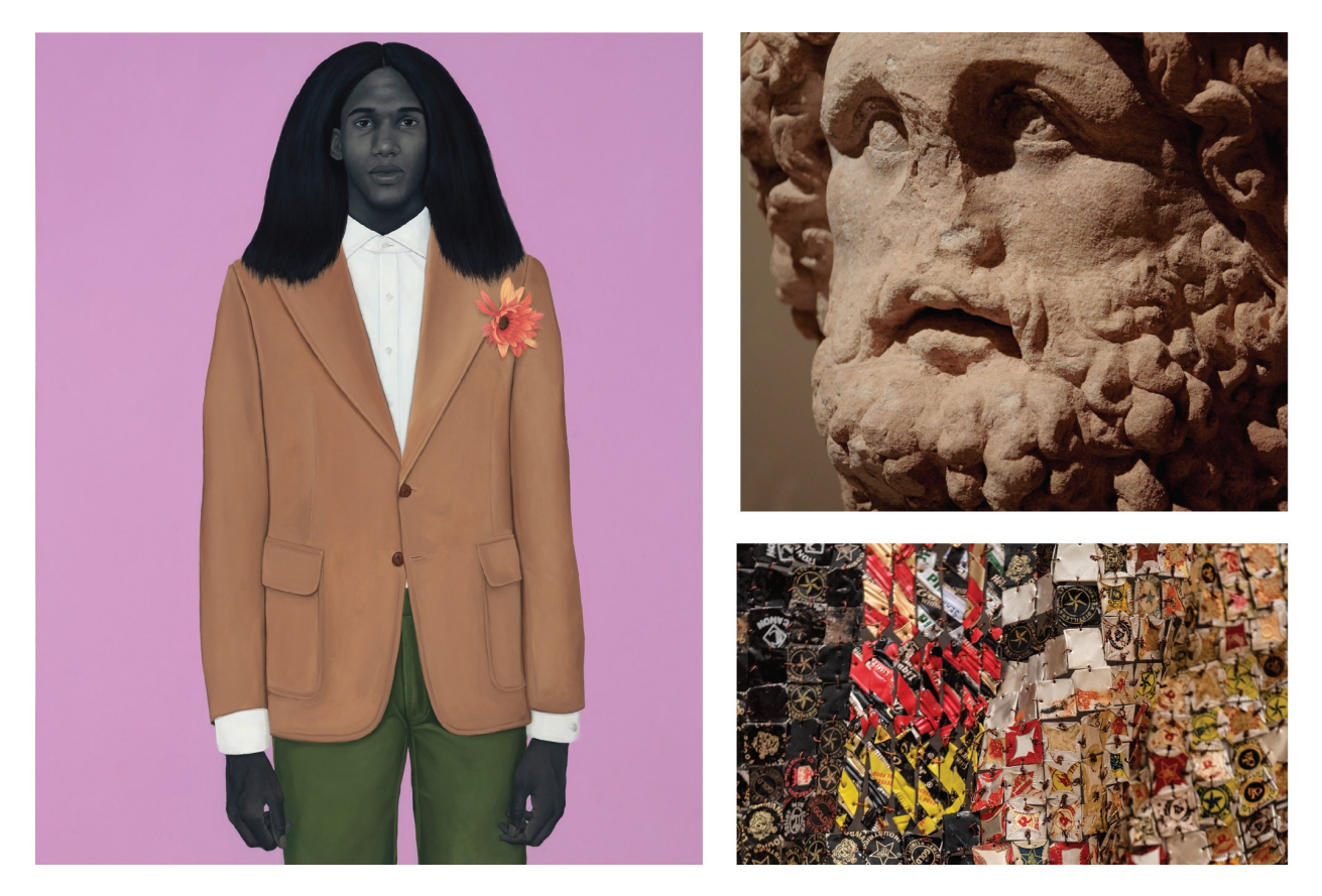
Clockwise from left: Amy Sherald's "When I let go of what I am, I become what I might be (Self-imagined atlas)," 2018; Bust of Dushara, from Petra, 1st century B.C.–1st century A.D.; Detail view of El Anatsui's "In the World But Don't Know the World," 2019.

This was a year of highs that included political protest in the art world, a historic Whitney Biennial, inspiring monuments and a revamped MoMA.