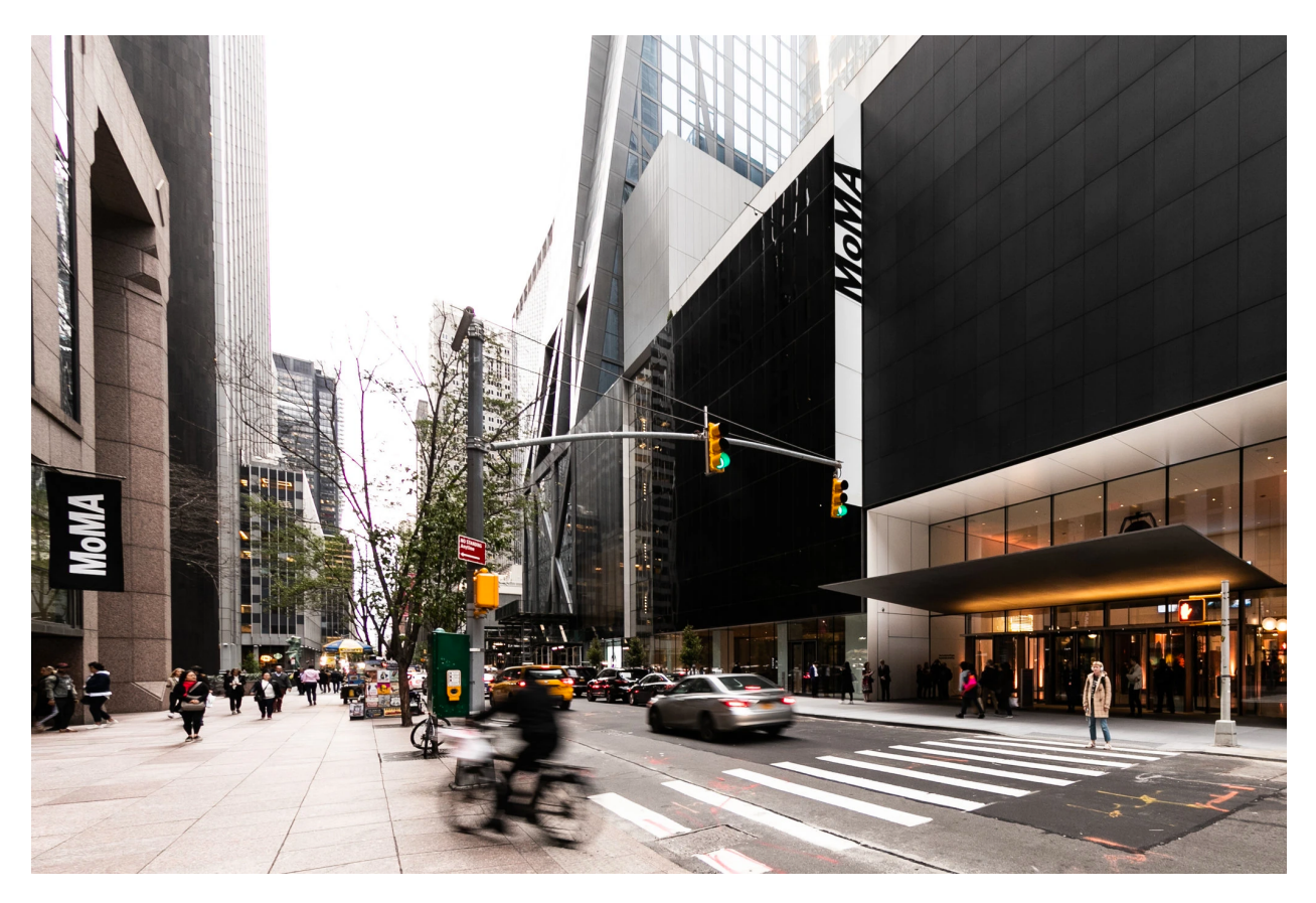
The newly reopened Museum of Modern Art.

From retrospectives to debut shows, and, yes, even the MoMA reopening, art held our attention with innovation and variety.