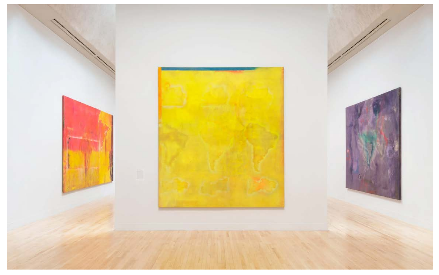
Ten of Mr. Bowling's renowned "map paintings," painted in New York in the late 1960s, are presented at Tate Britain.

It is worth seeing merely for the climactic gallery of 10 of his renowned "map paintings": washy, absorbing color-field abstractions overlaid with stencils of the continents, painted in New York in the late 1960s. The map paintings are late-modernist masterpieces, and represent a major missing link in the story of postwar art — roiling, epic works scarred by the history of three continents.