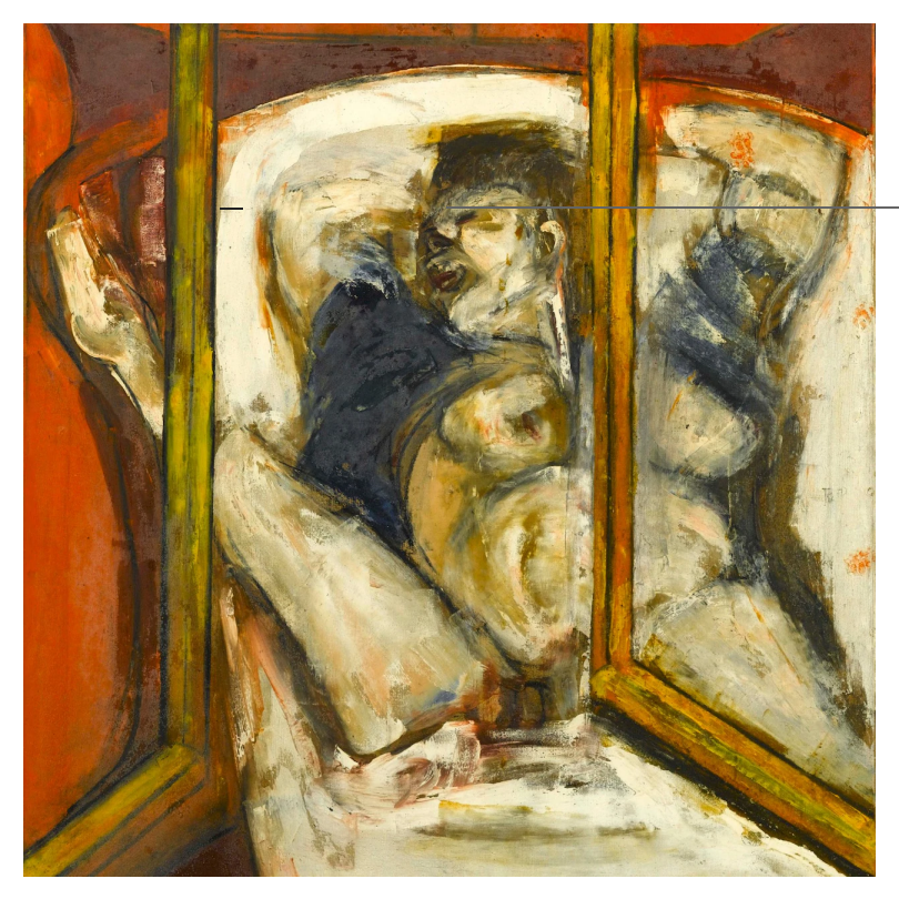
Birthday (1962, detail) by Frank Bowling

Bowling says some of the juxtapositions in his paintings have the drama of everyone's struggle to cope with existence – with politics, society, the difficulty of living with others. What he used to spell out as social comment he now suggests by visual poetry. He points to the flash of bright colour against the pale haze. "Paint takes over and does things. It can internalise this spiritual jumping about, where people are continually dodging away from disaster, coming into contact with each other, backing up and dancing away."