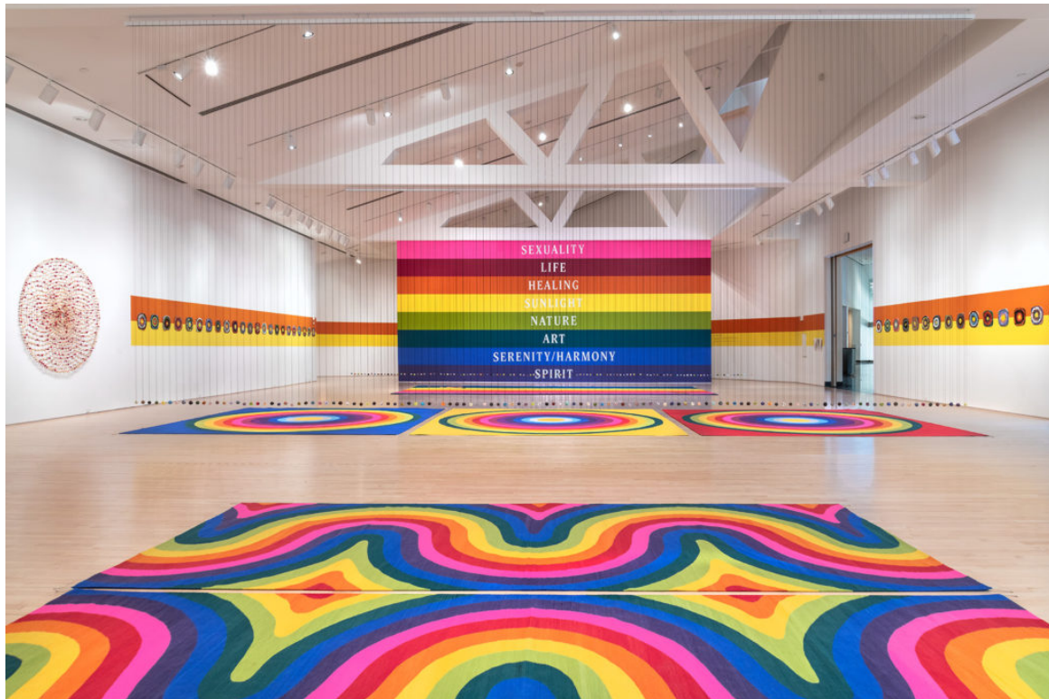
Installation view, Waiting for the UFOs (a space set between a landscape and a bunch of flowers), January 24–April 28, 2019, Charlotte Crosby Kemper Gallery, Kemper Museum of Contemporary Art, Kansas City, Missouri. © 2019 Polly Apfelbaum/Artists Rights Society (ARS), New York, and courtesy of the artist, Alexander Gray Associates, New York, Frith Street Gallery, London, and Galerie nächst St. Stephan Rosemarie Schwarzwälder, Vienna, Austria. Photo by E.G. Schempf.

Polly Apfelbaum's exhibition, Waiting for the UFOs , at the Kemper Museum of Contemporary Art envelops visitors in a gleeful mood that is hard to avoid even if one lacks an affinity for strong colors. Its large open space is punctuated by polychromatic ceramic targets, clay beads, and woven rugs. Concentric circles, undulating motifs, and horizontal bands, coated in a rainbow of color, are just a few of the elements that give structure to this eclectic installation. Merging the poetics and politics of gender, Apfelbaum sets up an otherworldly space that symbolically reconciles differences. She suggests that just as aesthetic balance can be reached through the juxtaposition of seemingly incongruous colors and patterns, peaceful co-existence and gender equity are achievable goals that cannot be deferred.