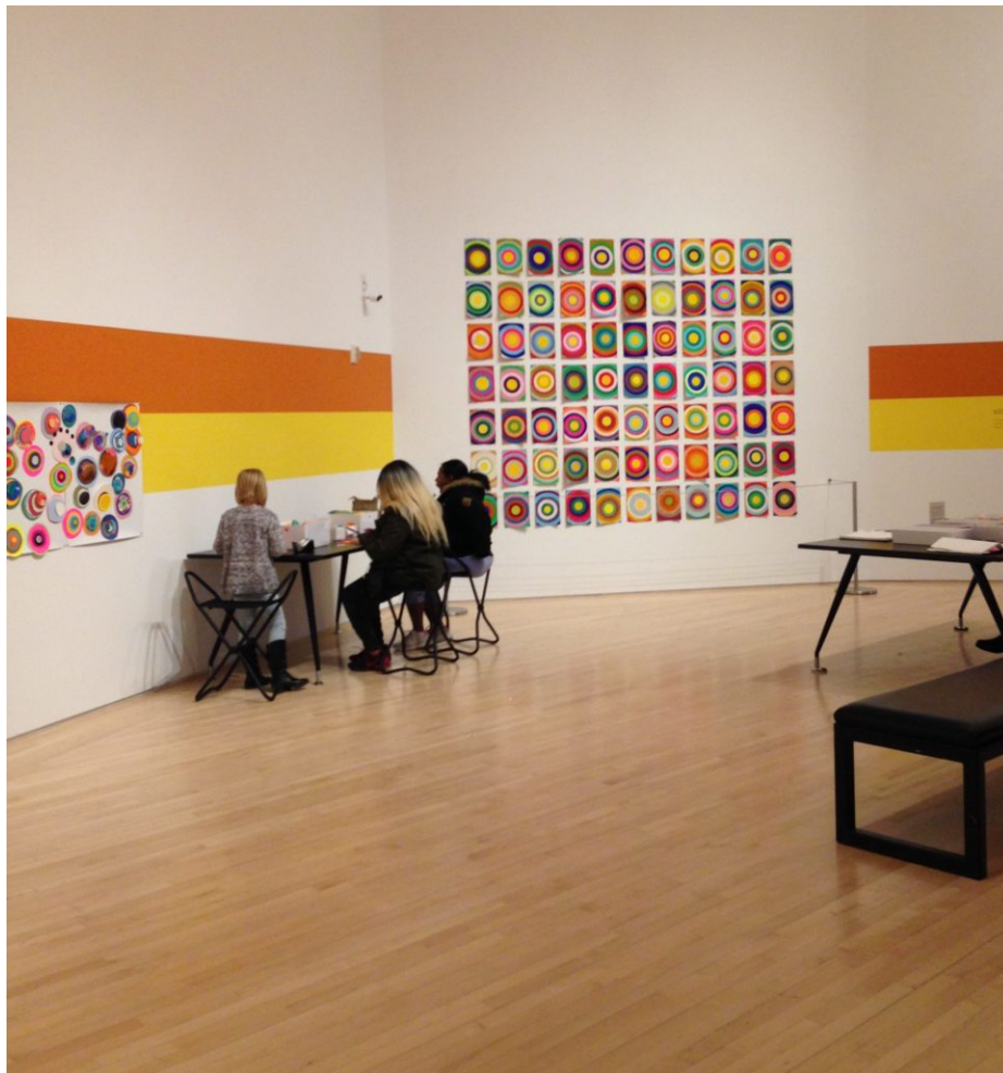
Visitors utilizing Kemper Museum's education space with Sun Target Drawings , 2018, in Polly Apfelbaum: Waiting for the UFOs (a space set between a landscape and a bunch of flowers) , January 24–April 28, 2019, Charlotte Crosby Kemper Gallery, Kemper Museum of Contemporary Art, Kansas City, Missouri. © 2019 Polly Apfelbaum/Artists Rights Society (ARS), New York, and courtesy of the artist, Alexander Gray Associates, New York, Frith Street Gallery, London, and Galerie nächst St. Stephan Rosemarie Schwarzwälder, Vienna, Austria.

The exhibition title, Waiting for the UFOs , references one of Graham Parker's songs from the late 1970s. Its lyrics imagine an alien invasion that may help humans discover their own otherness as they approach the brink of extinction after extensively relying on institutions that regulate their lives and beliefs. Taking after punk rock music, Apfelbaum confronts viewers with a powerful rhythm conveyed by notes of jarring yellow, hot pink, and cobalt blue. One would find these throbbing colors disruptive were it not for the unified aesthetic of the exhibition, and the hopeful expectation it transmits. To make her color-coded message sink in even further, Apfelbaum chose to paint a wall in the color bands of Gilbert Baker's 1978 gay pride flag, pairing each of them with values such as sexuality, life, healing, sunlight, nature, art, serenity/harmony, and spirit. While she has often dabbled in conceptual play by choosing work titles that expand the connotations of her practice, up to now Apfelbaum has avoided integrating actual text in her works. Perhaps she feels that somber times, when LGBT and women's rights are increasingly menaced, call for more explicit political gestures. Yet, this exhibition does not stop short at this message that might seem overly didactic. It conveys longing for a welcoming space where identity categories dissolve and we come face to face with our inscrutable otherness in relation to other cosmic beings.