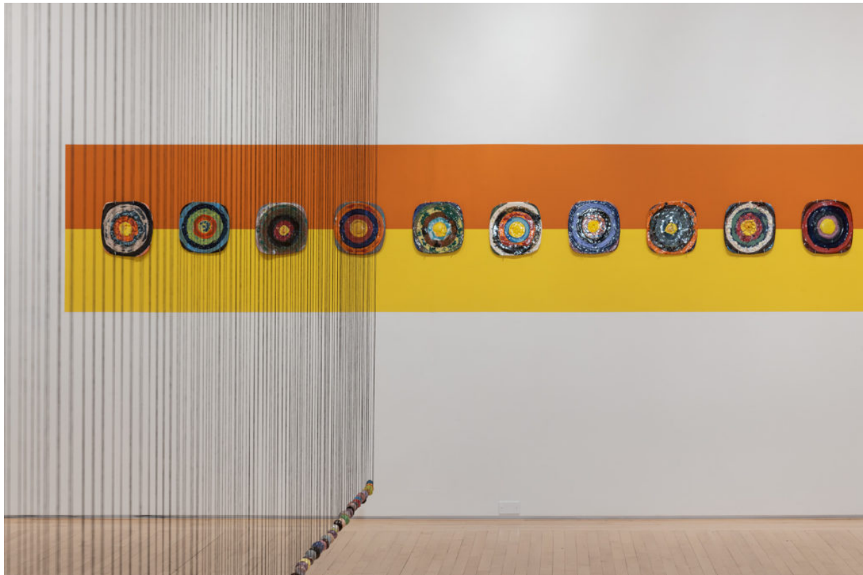
Polly Apfelbaum, Kneeline , 2019 and Sun Targets , 2018 in Waiting for the UFOs (a space set between a landscape and a bunch of flowers) , January 24–April 28, 2019, Charlotte Crosby Kemper Gallery, Kemper Museum of Contemporary Art, Kansas City, Missouri. © 2019 Polly Apfelbaum/Artists Rights Society (ARS), New York, and courtesy of the artist, Alexander Gray Associates, New York, Frith Street Gallery, London, and Galerie nächst St. Stephan Rosemarie Schwarzwälder, Vienna, Austria.

Modeled after planets and constellations, 135 colorful ceramics called Sun Targets (2018) are arranged against a vibrant orange and yellow band stretching across several gallery walls. Diverse in terms of color combination and surface texture, they feature concentric circles radiating from a yellow center connotative of solar energy. To the pulsating visual rhythm of the targets surrounding the room, Apfelbaum counterposed the sensation of suspense evoked by hundreds of beads hanging from the ceiling and the feeling of lightness emanating from the smooth surface of floor rugs. Motion is inferred and deferred at every step. One cannot help but envision the beads knocking against each other, as in Newton's cradle, or picture the geometric patterns on the rugs becoming animated. The beads were inspired by the artist's growing fascination with glazed terracotta at the time of her visit to Italy. The rugs also bear connections to another cultural space. Based on traditional Mexican dyeing techniques, they were woven in Oaxaca at the artist's direction. Their circular patterns and vivid colors call to mind Harmony Hammond's Floorpieces from the 1970s which blurred the boundaries between art and craft and evoked queer spaces. Just as Hammond, Apfelbaum has been preoccupied with overcoming binaries and undermining heteronormative codes that permeate the aesthetic realm.