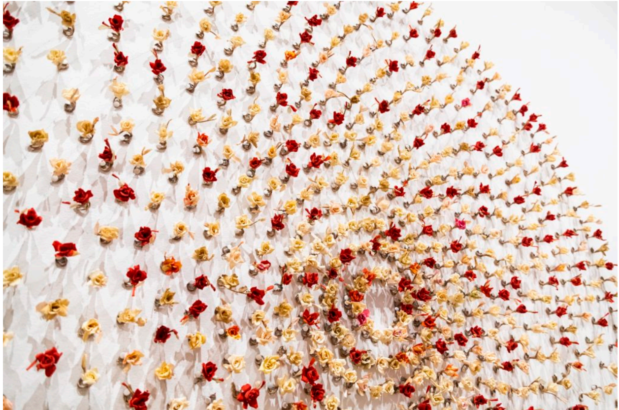
Installation view, Wallflowers (Mixed Emotions) , 1998–1991/2019, in Waiting for the UFOs (a space set between a landscape and a bunch of flowers) , January 24–April 28, 2019, Charlotte Crosby Kemper Gallery, Kemper Museum of Contemporary Art, Kansas City, Missouri. © 2019 Polly Apfelbaum/Artists Rights Society (ARS), New York, and courtesy of the artist, Alexander Gray Associates, New York, Frith Street Gallery, London, and Galerie nächst St. Stephan Rosemarie Schwarzwälder, Vienna, Austria. Photo by E.G. Schempf.

The exhibition also features a series of 77 gouaches on paper titled Target Drawings (2018). These are exhibited in a significantly smaller adjacent gallery which serves as the art education space. Apfelbaum's decision to display these works in this context attests to her desire to undermine hierarchies. Thus, painting, the most privileged artistic medium, comes closer to craft and the do-it-yourself aesthetic, especially since these works portraying concentric circles are unframed and lack a label indicating that they were produced by Apfelbaum. Through the pulsating vibration they evoke, the Target Drawings are reminiscent of the virtual movement of Op art. They also recall Josef Albers's prolific inquiry into color perception and Kenneth Noland's color fields reverberating with energy.