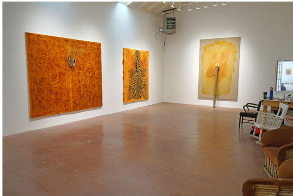
Studio photo: Clayton Porter, 2019.