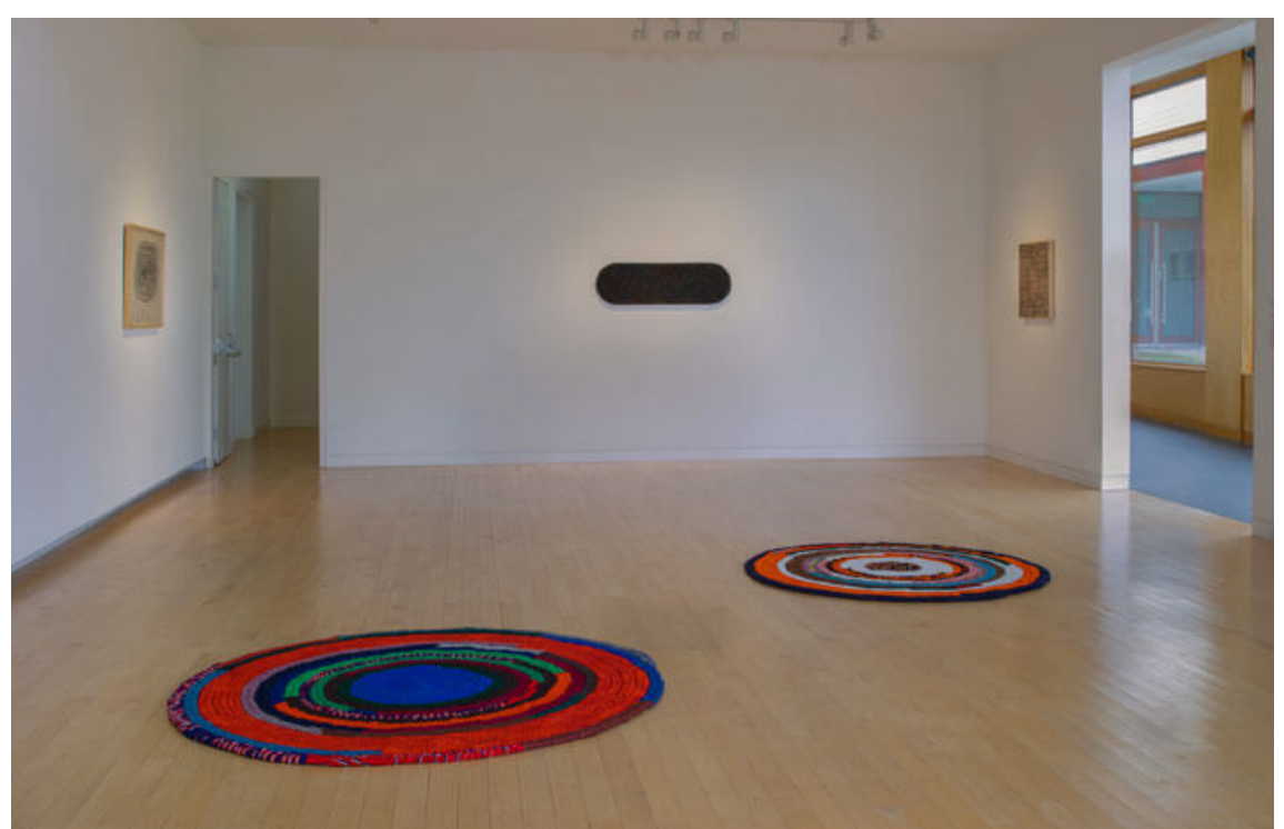
Foreground: Floorpieces VI and V , (1973) cloth and acrylic paint, dimensions variable; on walls left to right: An Oval Braid , 1972, charcoal on paper, 25 x 38 in; The Black Leaf , 1976, oil and Dorland's Wax Medium on canvas 14 x 45.5 in; Pink Weave , 1975, oil and Dorland's Wax Medium on canvas, 24.5 x 24.5 in. Art copyright Harmony Hammond/Licensed by VAGA at ARS, New York, NY.