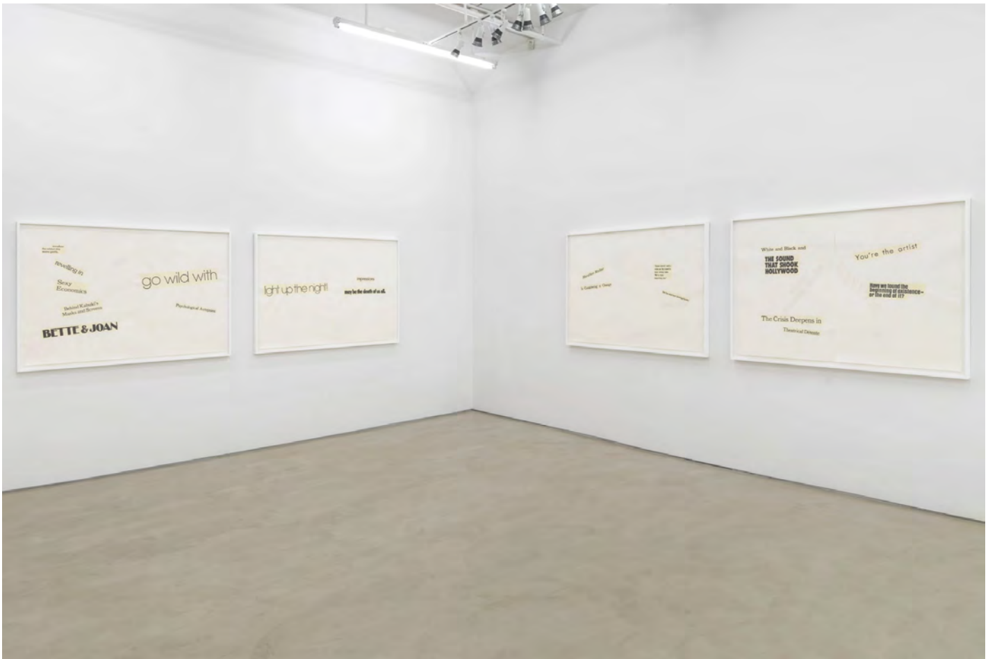
“Lorraine O’Grady: Cutting Out CONYT,” was an exhibition of her work using cut-out type from The New York Times.

On a personal level, he has college-age grandchildren and would “like to contribute as much as I can to that,” he said. “When the money comes, we can use it.”