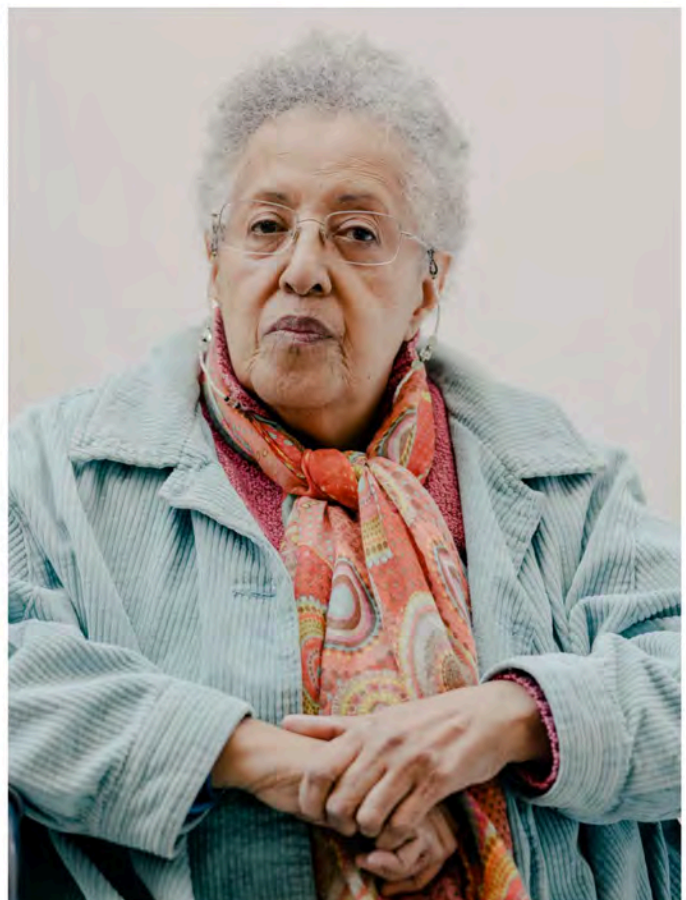
Howardena Pindell arrived in New York in 1967 to a cool reception; her abstract art was frowned upon by both white and black members of the art community. Her breakthrough came in 2015. Now 75, she uses a walker but is actively painting with the help of assistants.