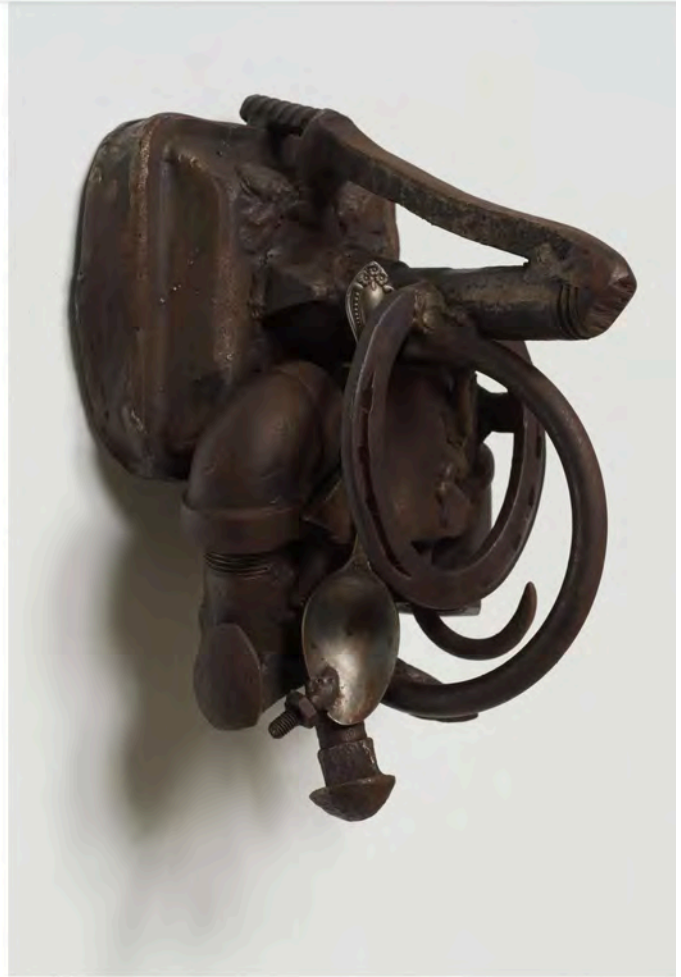
Mr. Edwards’s welded steel sculpture, “For Modie 218.” The show “Soul of a Nation: Art in the Age of Black Power,” at the Broad, shines a bright light on the work of Mr Edwards, Ms. O’Grady, Mr. Bowling and others.