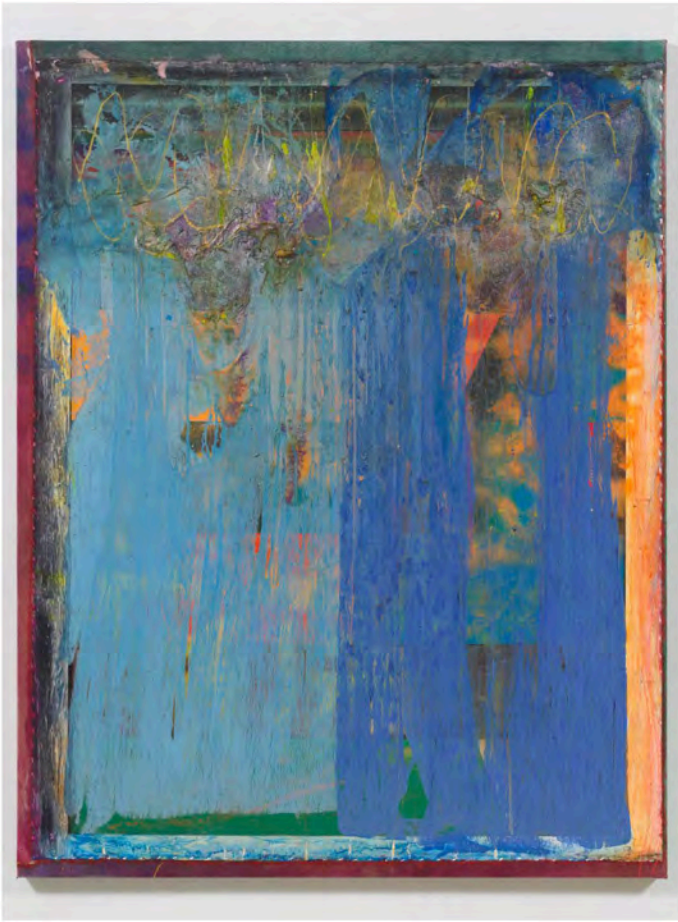
Last year Frank Bowling, 85, created “Two Blues,” acrylic and mixed media on collaged and printed canvas.