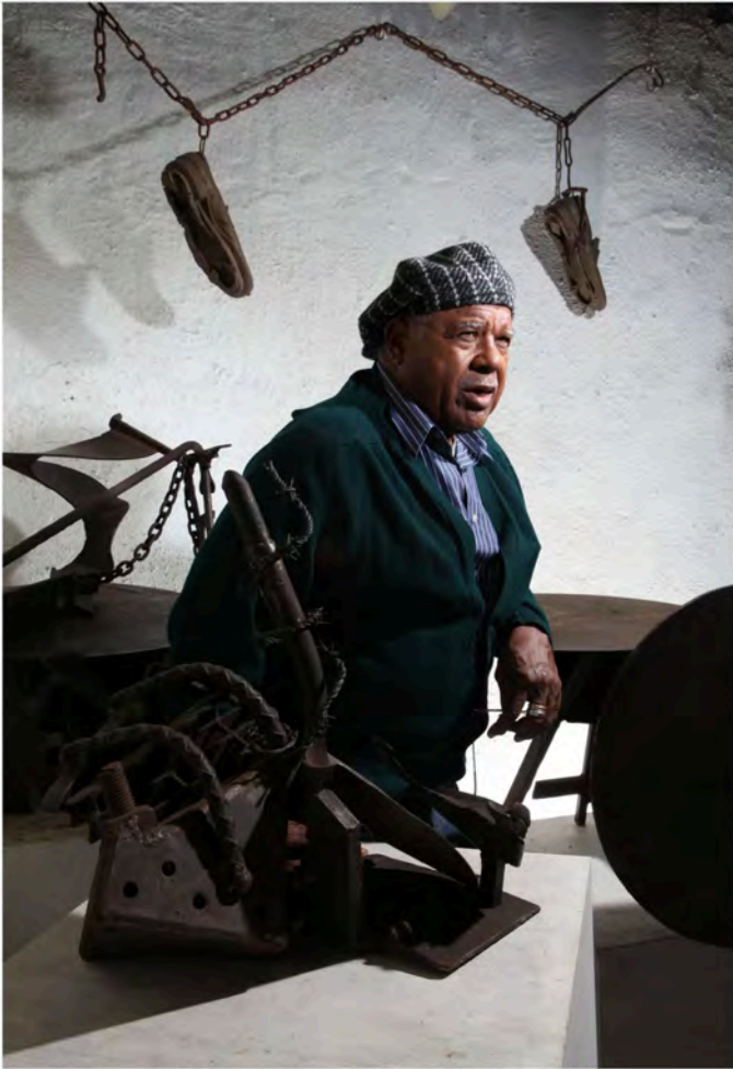
The sculptor Melvin Edwards at his studio in Plainfield, N.J., with “Nigba Lailai (The Past),” from 1979.