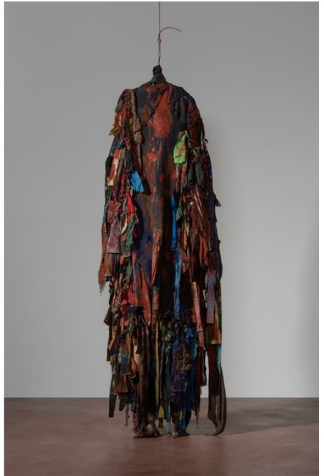
Left: Harmony Hammond – Sieve, 1999. Oil on metal and canvas, 17 x 18 1/2 in.; 43.18 x 46.99 cm. Collection of Barbara Johnson and Ruth Gresser © 2018 Harmony Hammond / Licensed by VAGA at Artists Rights Society (ARS), NY. Right: Harmony Hammond – Presence V, 1972. Acrylic, dye, cloth with rope, metal and wood, 78 x 28 in.; 198.12 x 71.12 cm. Courtesy of the artist and Alexander Gray Associates, New York © 2018 Harmony Hammond / Licensed by VAGA at Artists Rights Society (ARS), NY.