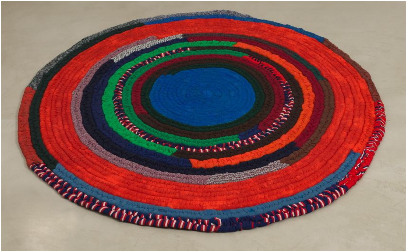
Harmony Hammond – Floorpiece VI, 1973. Acrylic on fabric 65 in. diameter (165.10 cm diameter). © 2018 Harmony Hammond /Licensed by VAGA at Artists Rights Society (ARS), NY.