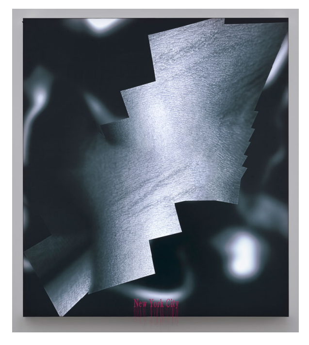
Seth Price, Untitled , 2015–18, dye-sublimation print on synthetic fabric, embroidery, aluminum, LED matrix, 80 x 90 x 4 inches. COURTESY THE ARTIST AND PETZEL NEW YORK

I think a lot of the appeal had to do with the rich compositions and colors—or in some cases, lack of color. Take for example the two black-and-white LED light boxes involving photographic fragments of what I assumed to be human flesh. They were already powerful enough, even without the words "New York City" embroidered down at the bottom in pink thread, with additional threads hanging below the edge of the support. What might have seemed arbitrary instead added to the mystery.