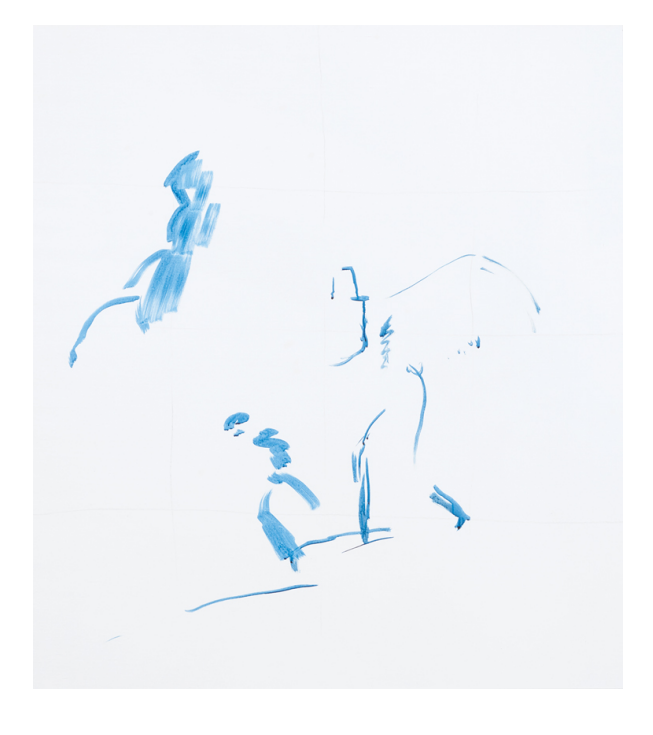
Michael Krebber, Herbes de Provence, Gitanes, 2018, acrylic on canvas, 45 \times 40 inches. Greene Naftali.

It's also thrilling to be in the presence of someone I would equate with a master calligrapher. What stuck with me long after I saw the show was the contrast between my impression when I first walked into the gallery and my feeling when I departed: What at first appeared to be faded works that had been pulled into the background later seemed thrust aggressively forward.