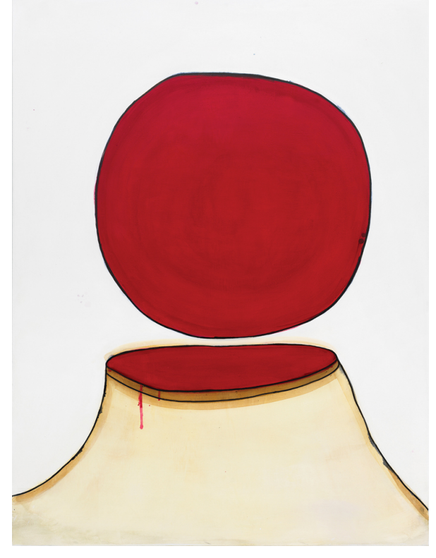
Christine Rebet, Sunset Stage 2, 2018, acrylic and ink on canvas, 48 \times 36 inches. Bureau.

In her leap from the origins of civilization to the contemporary wrecking of a cultural artifact—a dizzying compression of time—Rebet got me thinking, but not by particularly didactic means, about what mixed bags we are as human beings, so creative and, at the same time, so incredibly destructive. I read an article (https://www.newyorker.com/magazine/2017/09/18/the-case-against-civilization) a while ago in the New Yorker about hunter-gatherers. They had in many ways a much more reasonable and fair way of life than ours today, so much more in harmony with the planet. Then the storage of grain changed all that. Along came autocrats, slavery, greed, war, etc., but also art, literature, and the mind-boggling brilliance of what we could call culture.