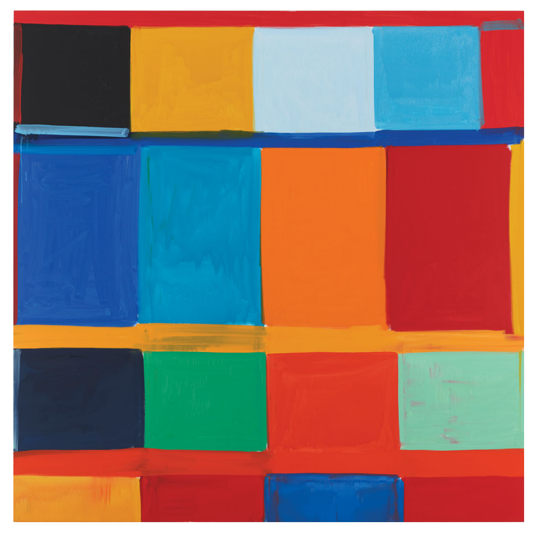
Stanley Whitney, They Came Dancing, 2018, 96 x 96 inches.

Another gorgeous show of painting was Michael Krebber's at Greene Naftali. In some ways, the exhibition was rather shocking. We don't think twice about minimal monochrome paintings these days, but there is still something radical about white ones with ever-so-slight marks on them.