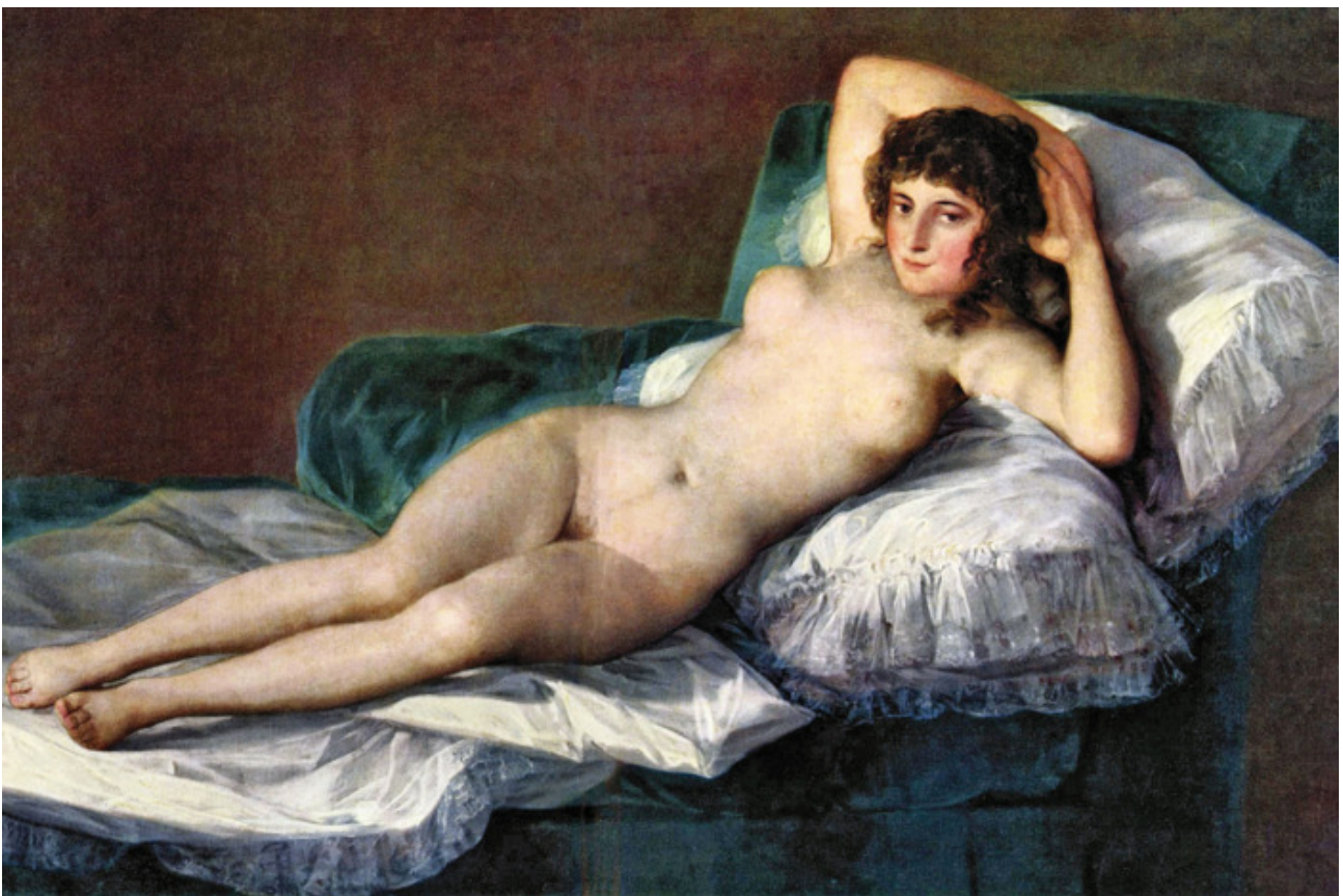
The Naked Maja , by Francisco Goya, 1797–1800.