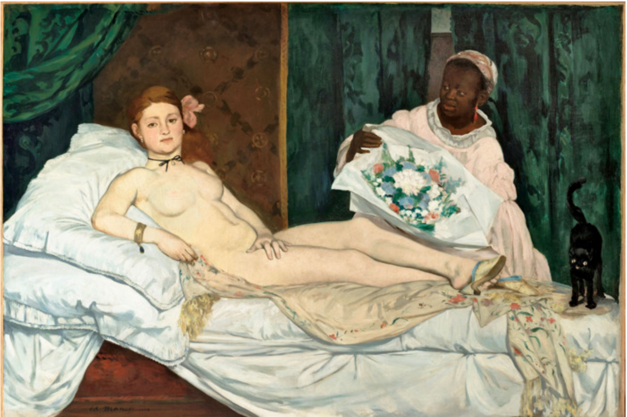
Olympia , by Édouard Manet, 1863.