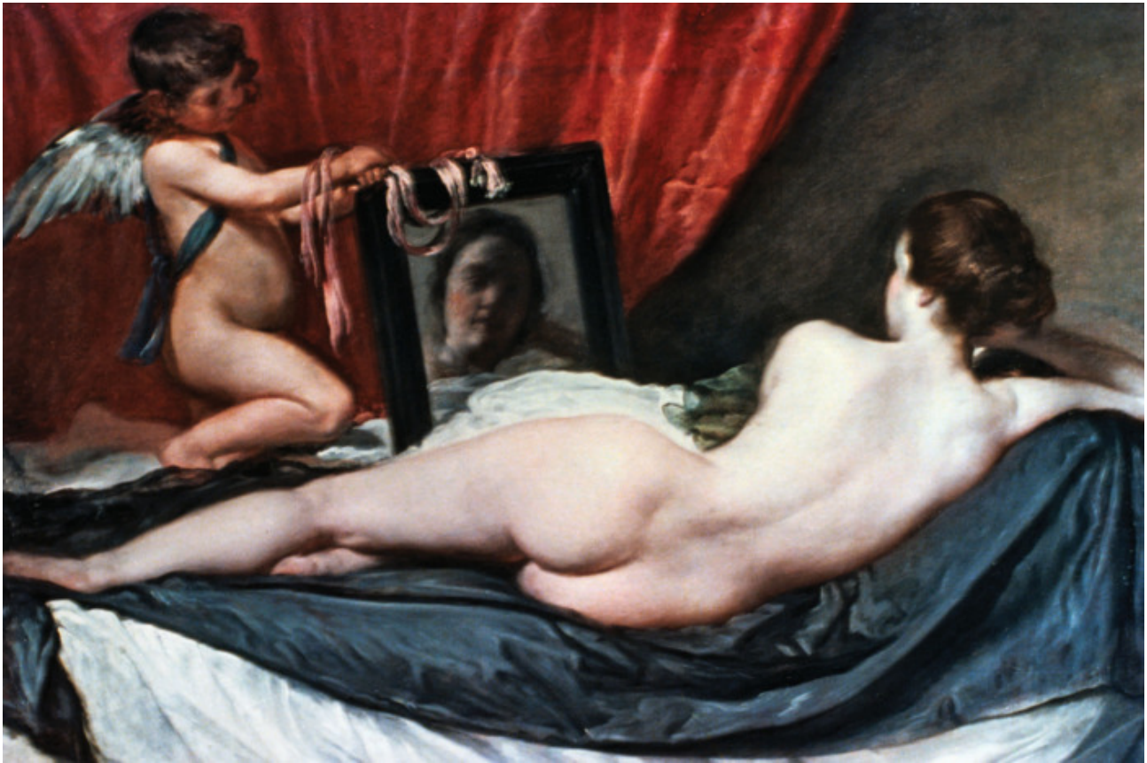
Rokeby Venus , by Diego Velázquez, 1647.