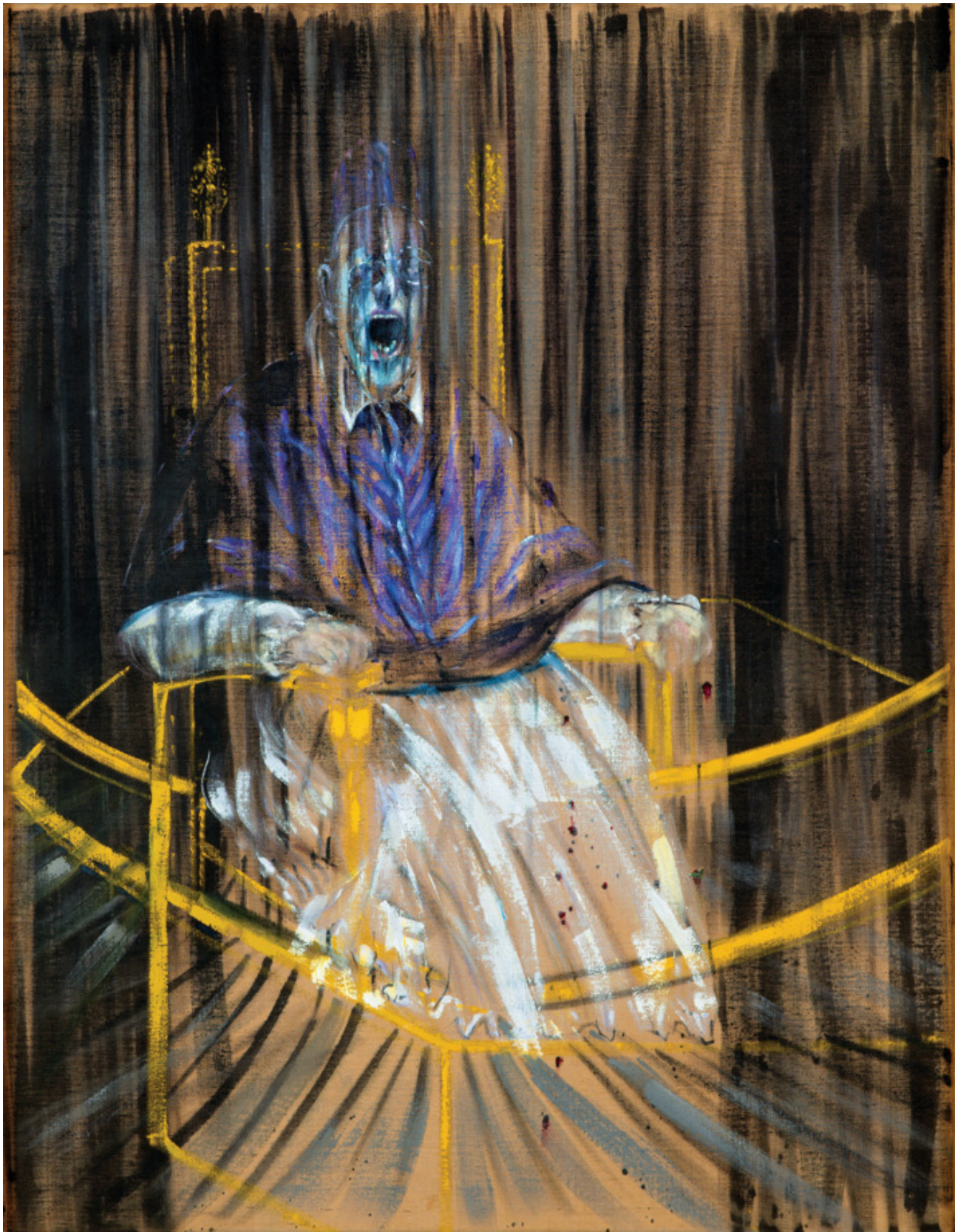
Is this painting about the pope or insanity?