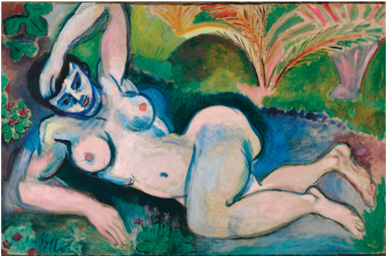
Blue Nude , by Henri Matisse, 1907.