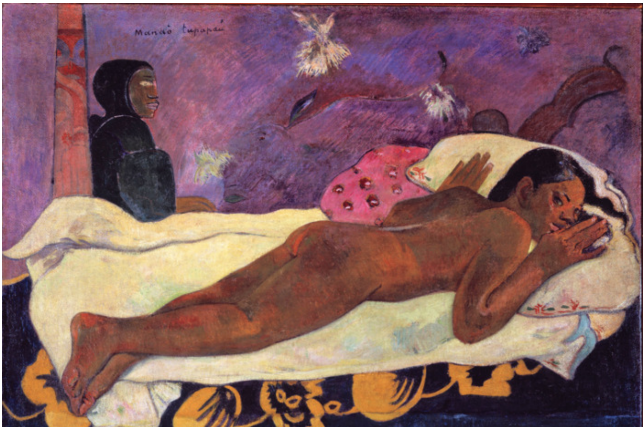
Spirit of the Dead Keeps Watch , by Paul Gauguin, 1892.