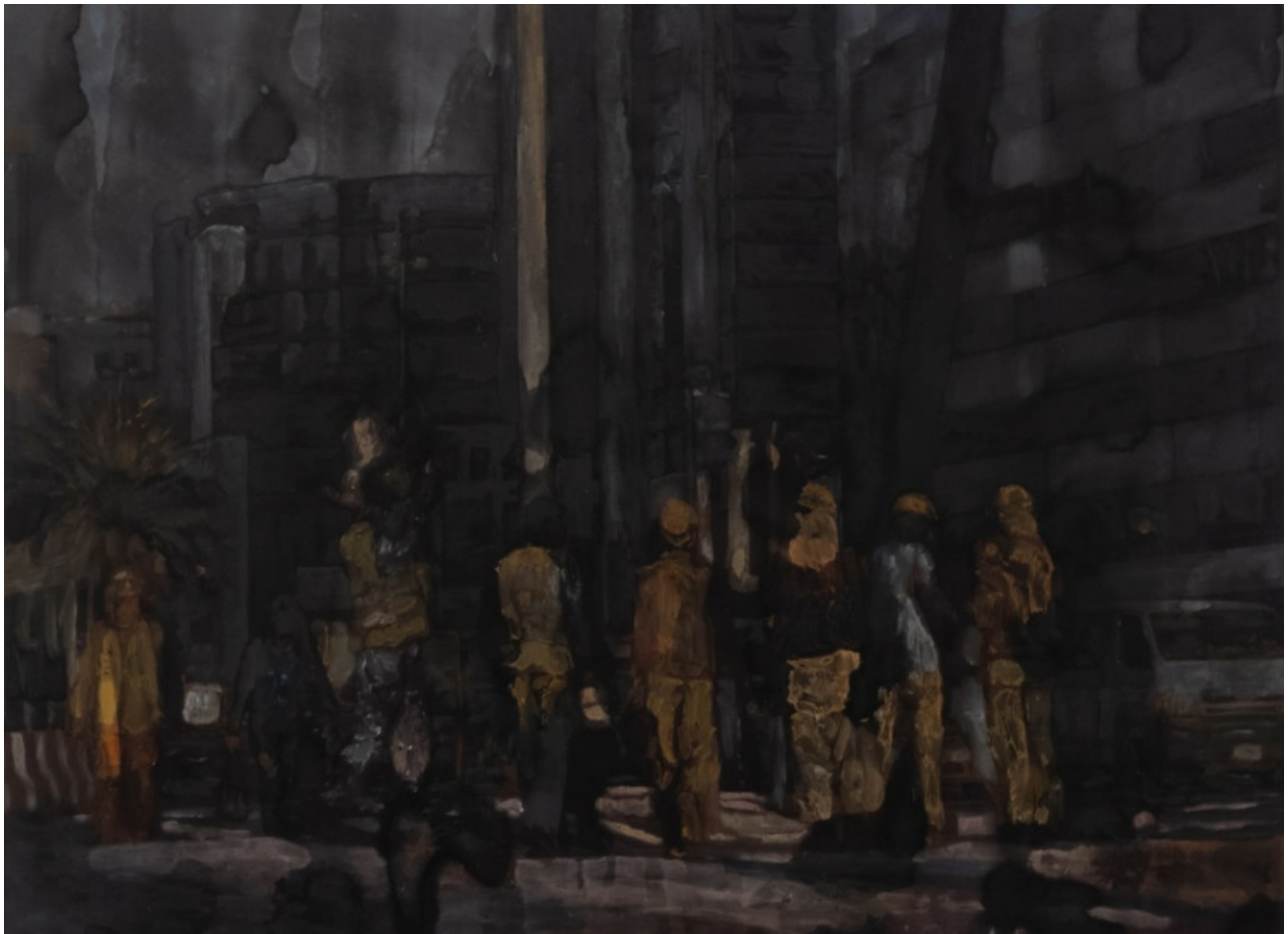
Even the Shade Does not Belong to Them, 2018. Acrylic and ink on canvas.

He used scratches on white paper to visualise sound and movement; he has used drawing and photography to depict what he sees around him; and he combined performance with photography and installation to document the daily routine of his job in a UAE army office. He has experimented with video and GPS coordinates to find his place in the rapidly changing landscape of the UAE, and to create immersive installations that invite viewers to contemplate their own position in a turbulent, changing world. But for his latest show in Dubai, titled A Prime Activity, the artist has returned to painting after more than two decades. The exhibition includes Kazem's paintings from the 1990s as well as new works created especially for the show.