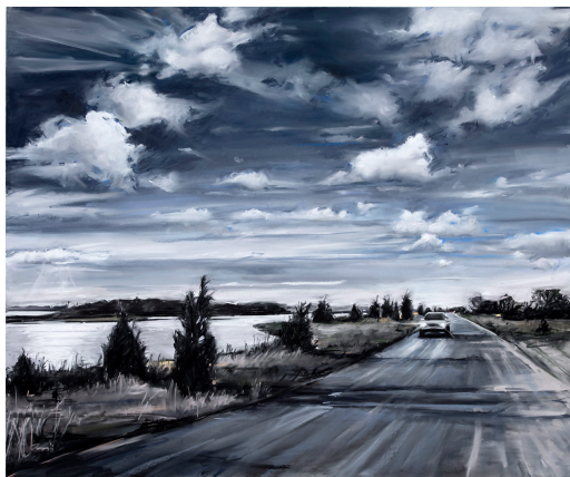
Susan Grossman Arrival , 2018 pastel and charcoal on paper 50 x 60 inches

Copyright © 2018, All rights reserved For further information and/or hi res images contact Catherine McCormick: catherine@mmfineart.com | 631.259.2274