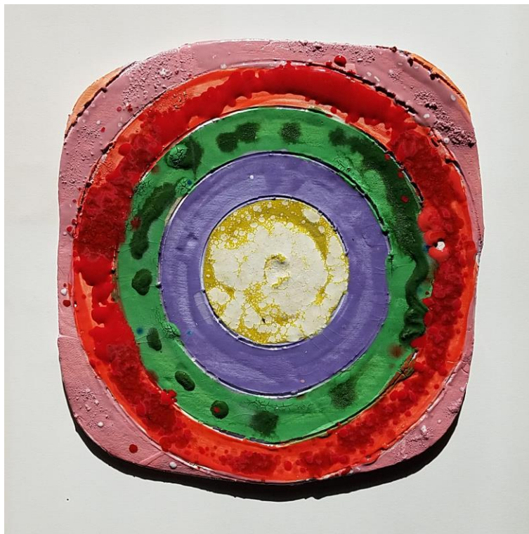
Polly Apfelbaum, Aquarius (2018). Ceramic and glaze, courtesy the artist and Frith Street Gallery, London

Ikon presents a major exhibition of new and recent work by internationally renowned New York-based artist Polly Apfelbaum (born 1955), 19 September — 18 November 2018. Entitled Waiting for the UFOs (a space set between a landscape and a bunch of flowers) , the exhibition exemplifies Apfelbaum's interest in "space, obsession and otherness". Featuring large-scale colourful installations comprising textiles, ceramics and drawings, Apfelbaum's practice is framed within wider sociological and political contexts, and the legacy of post-war American art.