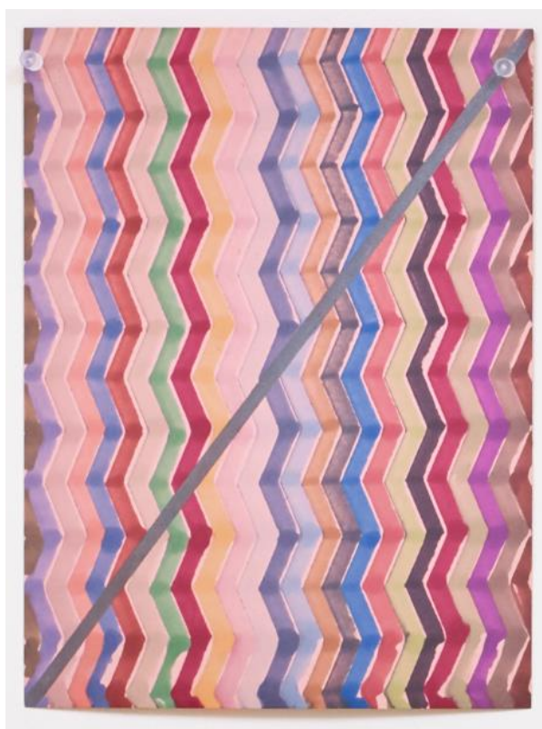
Polly Apfelbaum, Basic Division (Wavy Gravy) (2012). Marker pen on paper, courtesy the artist and Frith Street Gallery, London. © Polly Apfelbaum