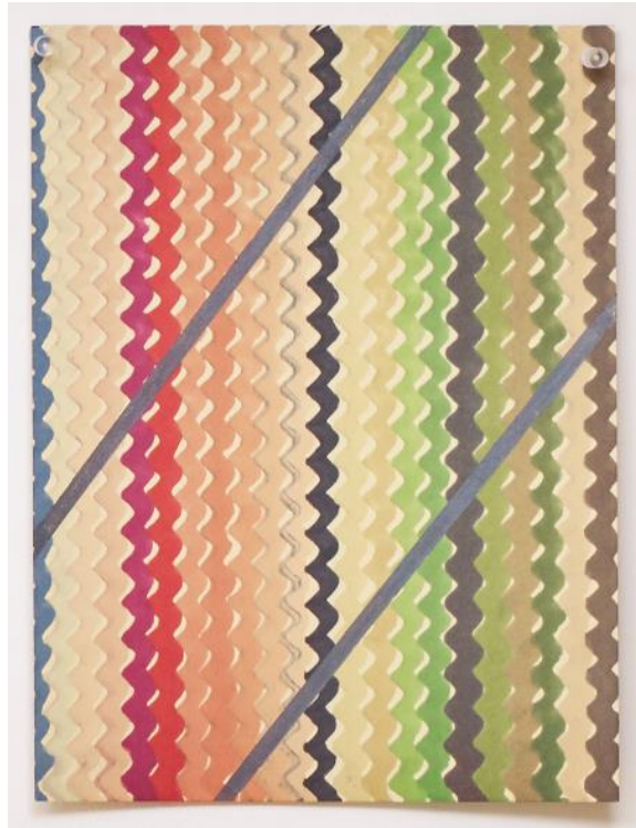
Polly Apfelbaum, Basic Division (Wavy Gravy) (2012). Marker pen on paper, courtesy the artist and Frith Street Gallery, London. © Polly Apfelbaum

Ikon Gallery 1 Oozells Square, Brindleyplace, Birmingham B1 2HS 0121 248 0708 / www.ikon-gallery.org Open Tuesday-Sunday & Bank Holiday Mondays, 11am-5pm / free entry Registered charity no. 528892