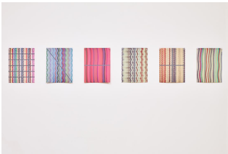
Polly Apfelbaum, Basic Division (Wavy Gravies) (2012). Marker pen on paper, courtesy the artist and Frith Street Gallery, London. © Polly Apfelbaum

Ikon Gallery 1 Oozells Square, Brindleyplace, Birmingham B1 2HS 0121 248 0708 / www.ikon-gallery.org Open Tuesday-Sunday & Bank Holiday Mondays, 11am-5pm / free entry Registered charity no. 528892