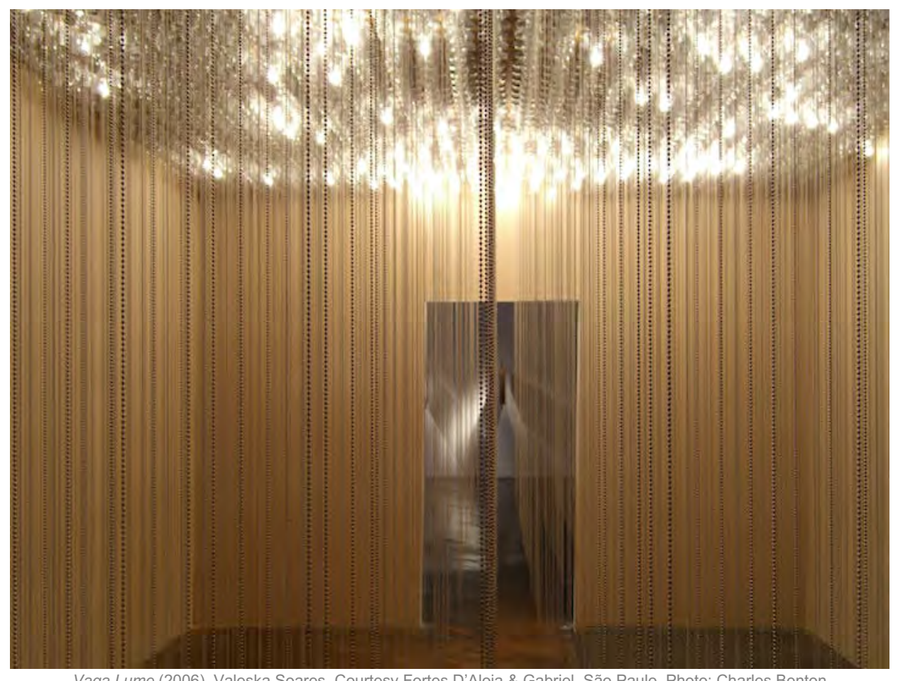
Vaga Lume (2006), Valeska Soares.