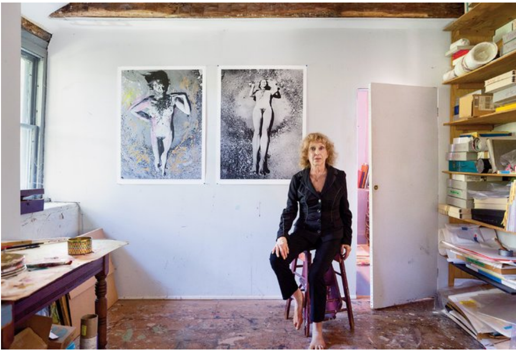
Schneemann in her New Paltz, N.Y., studio.