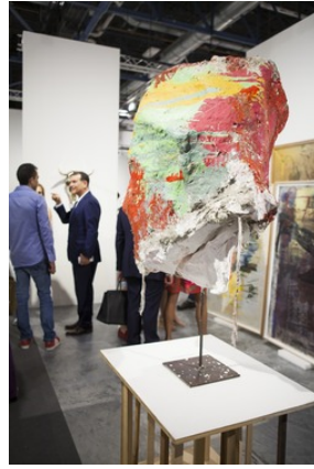
Franz West, Untitled (2010)