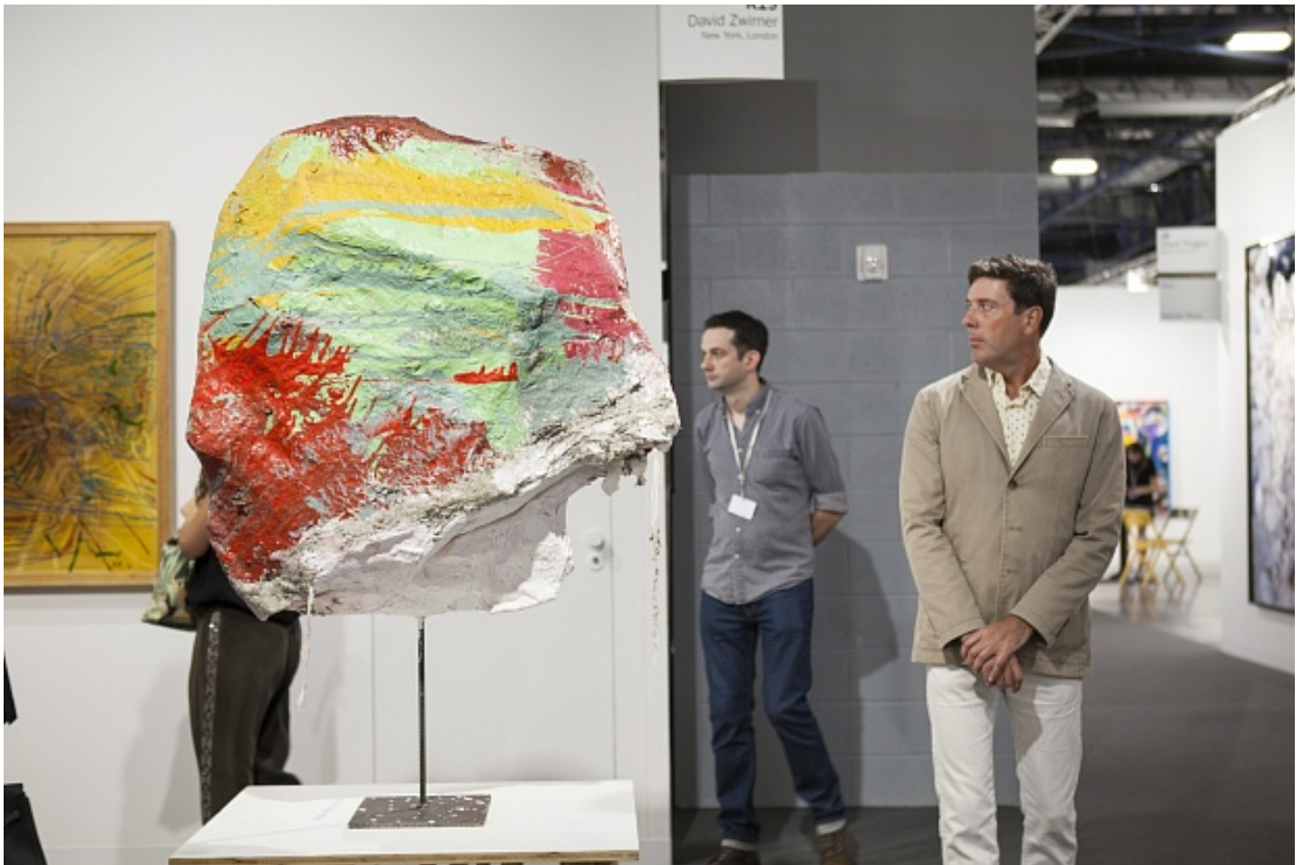
Franz West, Untitled (2010)