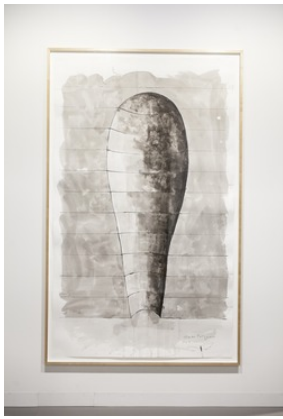
Martin Puryear, Niche (1999)