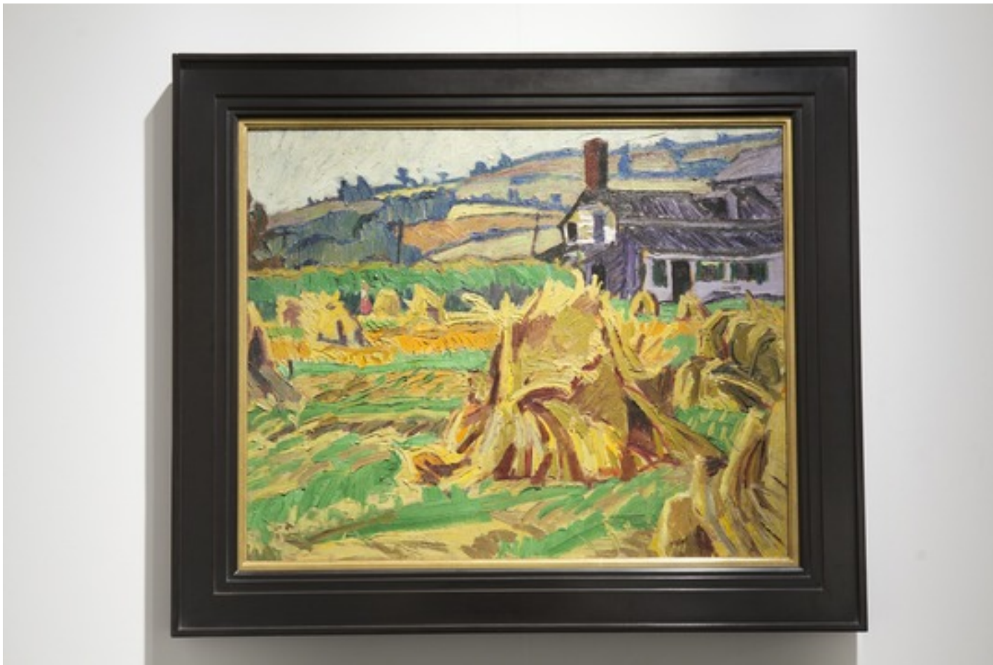
Stuart Davis. Corn Shocks, Tioga, Pennsylvania (1919)