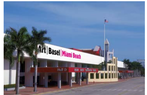
Art Basel Miami Beach.

The text that Tiravanija has placed upon the Times is just as direct—it reads, "The tyranny of common sense has reached its final stage." The quote is taken from ( http://aar.gsapp.org/ie/files/ValderrabanoMontanes_0910DIALECTICAL-CONSTRUCTION.pdf ) remarks that architect Aldo Van Eyck made to the Congrès International d'Architecture Moderne in 1947, and it's already been used by Tiravanija for another, more modest work. After a talk the artist did with curator Hans Ulrich Obrist and Albanian prime minister Edi Rama at Marian Goodman on 57th Street earlier this month—which occurred as the gallery's block was on lockdown by police and Secret Service protecting Trump Tower from protestors—Obrist loaded ( https://www.instagram.com/p/BMuZ-YMhat6/?tagged=edirama&hl=en ) onto his Instagram an image of a Post-It note drawn by Tiravanija and Rama. Scrawled on the Post-It is "The tyranny of common sense has reached its final stage," with the words coming down from a crudely drawn Trump Tower.