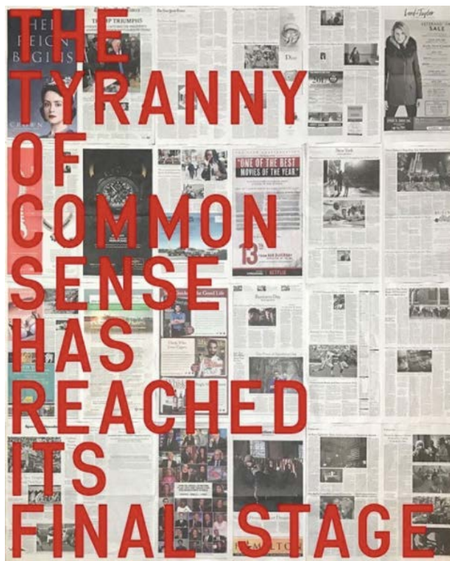
Rirkrit Tiravanija, The Tyranny of Common Sense Has Reached its Final Stage , 2016.