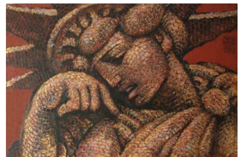
Martin Wong, Untitled (Statue of Liberty), 1988.