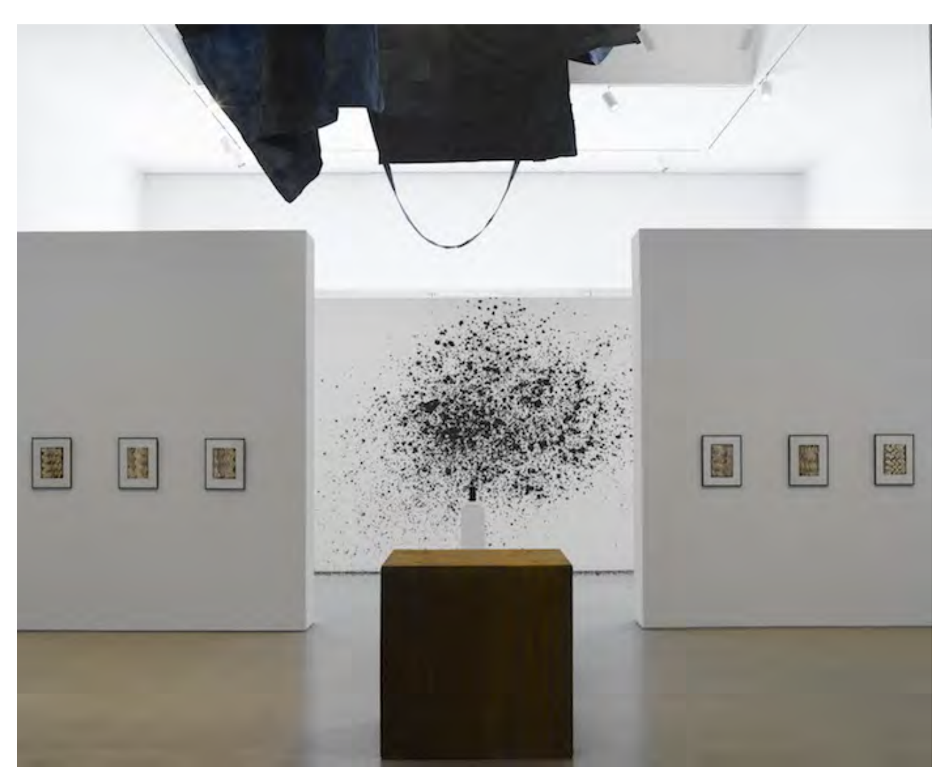
Installation view of Blackness in Abstraction Pace Gallery 510 West 25th Street, New York, June 24, August 19, 2016.

stood silently reaching into a basket and throwing a sticky black pulp against a white wall. The now-infamous protester who threw his shoe at President George W. Bush inspired the site-specific scene. The results of Mutu's performance now adorn the gallery walls in a material protest. Mutu's action also brings to mind writer Zora Neale Hurston's essay, "How It Feels To Be Colored Me (http://www.ycps.org/wp-content/uploads/2016/06/How-it-Feels-to-be-Colored-Me-by-Zora-Neale-Hurston.pdf)." Embodied in Mutu's constrained throws is the full force of blackness and a visual translation of Hurston's famous 1928 declaration: "I feel most colored when I am thrown against a sharp white background."