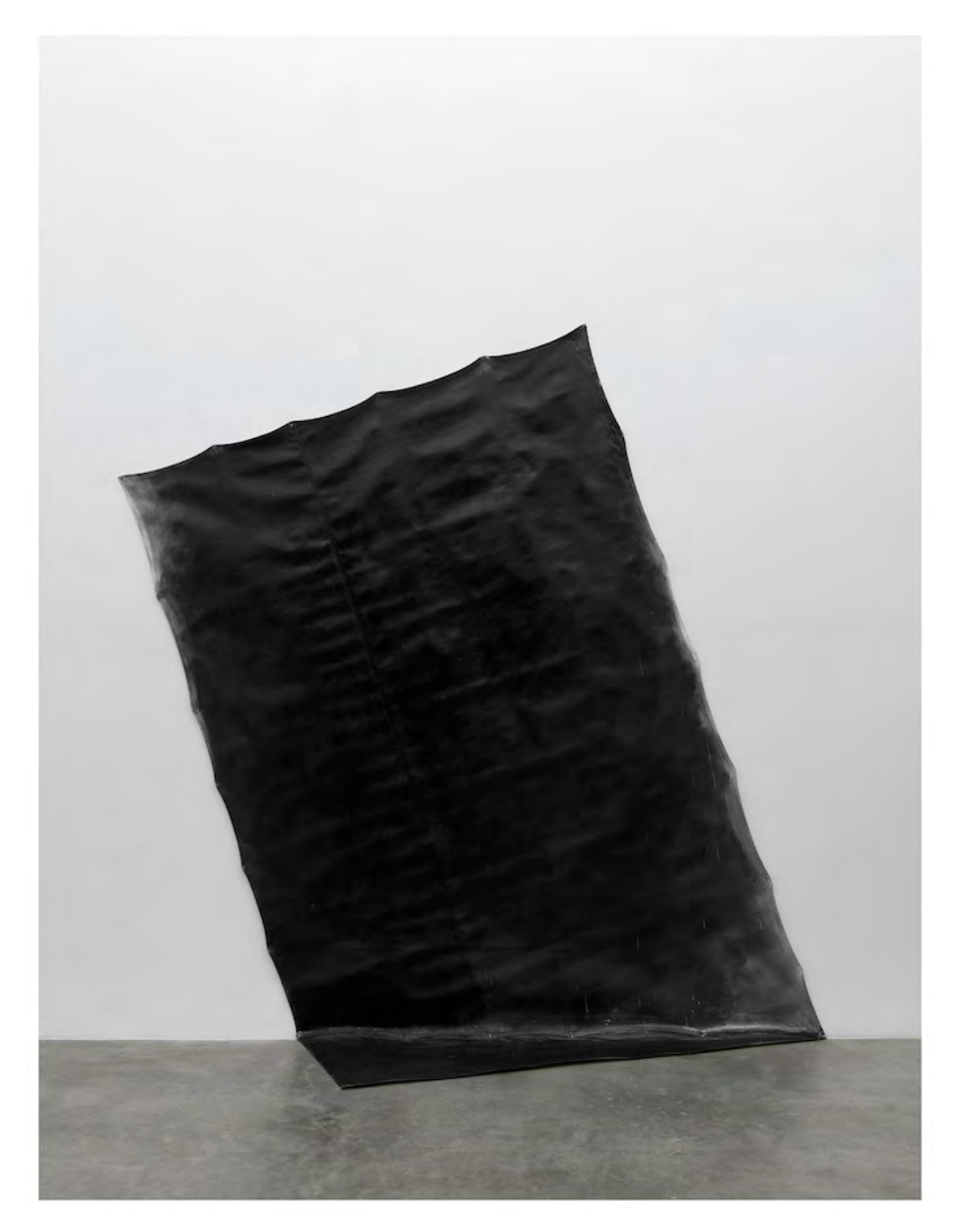
Koji Enokura, Figure No. 7, 1982, acrylic on cotton. 83" \times 81-1/8" \times 18-1/8" (210.8 cm \times 206.1 cm \times 46 cm).

"Blackness, in the fullest sense of the word, has a seemingly unlimited usefulness in the history of modern art," Edwards writes in the exhibition catalogue, echoing her 2015 essay. "Blackness in Abstraction is a form of visual note taking, entirely provisional, experimental, suggestive, and capacious,