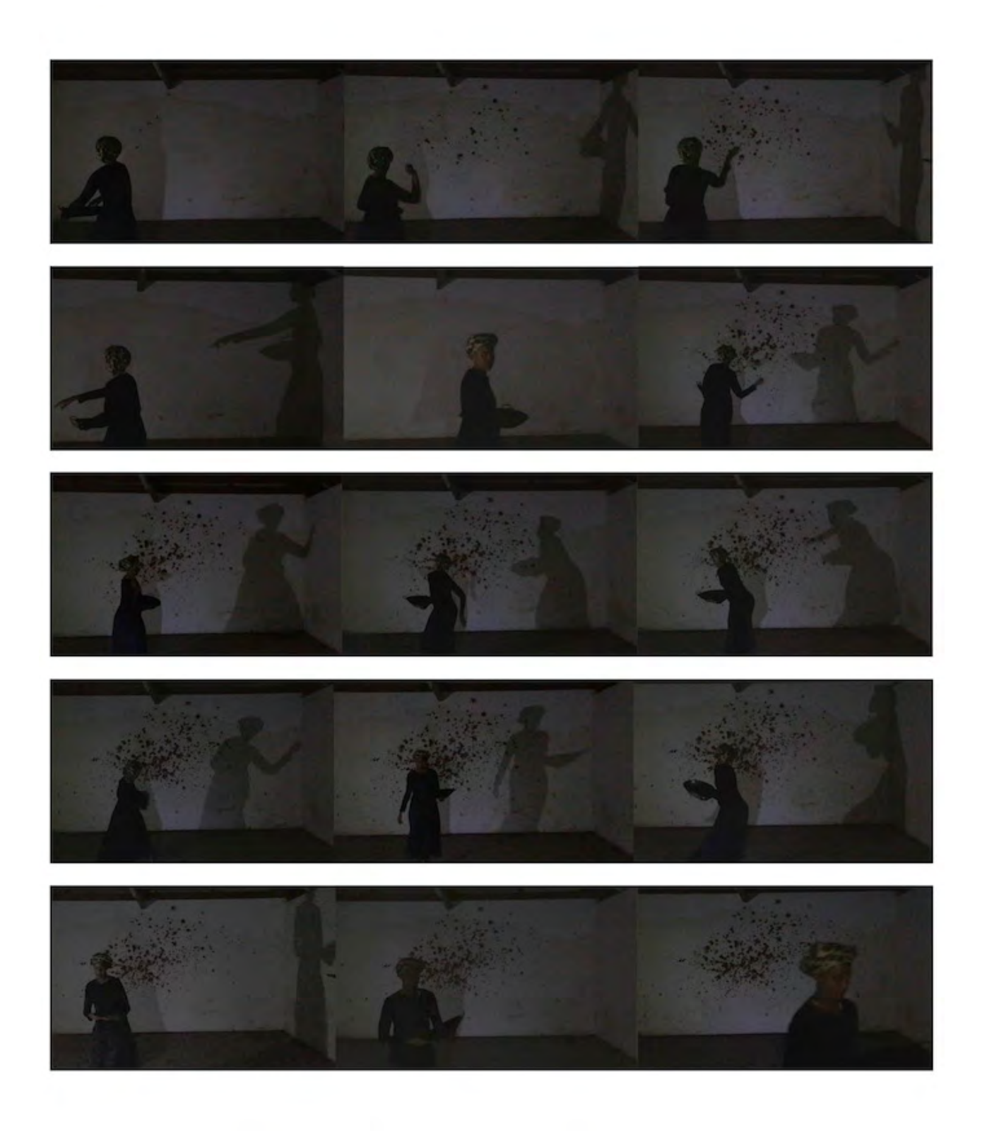
Wangechi Mutu, Throw, 2016, site specific action painting site specific dimensions. Courtesy the artist. Photograph courtesy the artist © Wangechi Mutu

The deep exploration the art in Edward's exhibition allows into the color black and its many meanings is also seen in Wangechi Mutu's performance, Throw . The work, which is a part of the "To Come Thickly" section of the exhibition, occurred before the show opened to the public. A barefooted Mutu, dressed in a long black dress and matching gloves, strolled into Pace Gallery, and for a few minutes