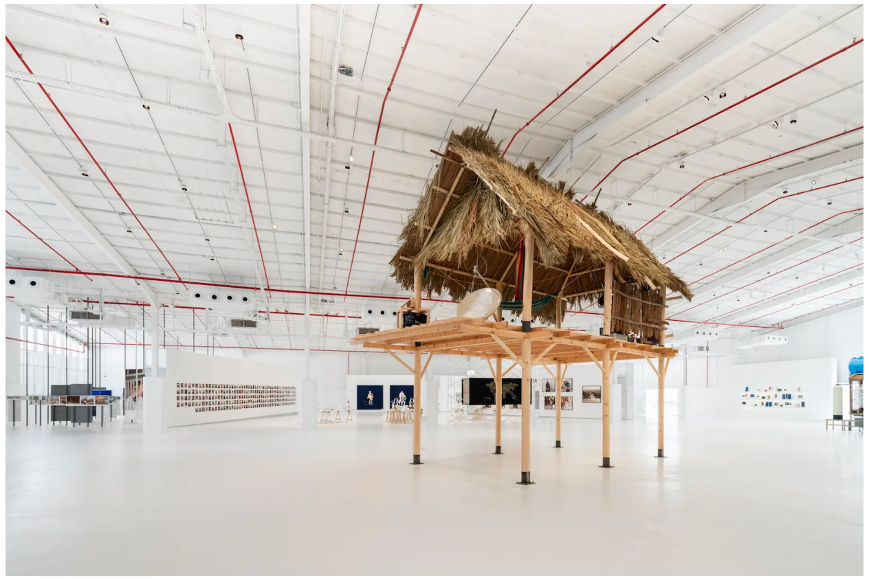
"After Rain", Diriyah Contemporary Art Biennale 2024, installation view, Marjetica Potrč, 'Acre Palafita with Infrastructure' (2024).

When rain hits dry soil or rock, petrichor, an enticing, earthy scent, is emitted. Humans have an uncanny capacity to perceive petrichor; some studies say we can detect it faster than sharks do blood in water. The "why" of that is a mystery, but it could be our unconscious recognizing of the necessity of rain.