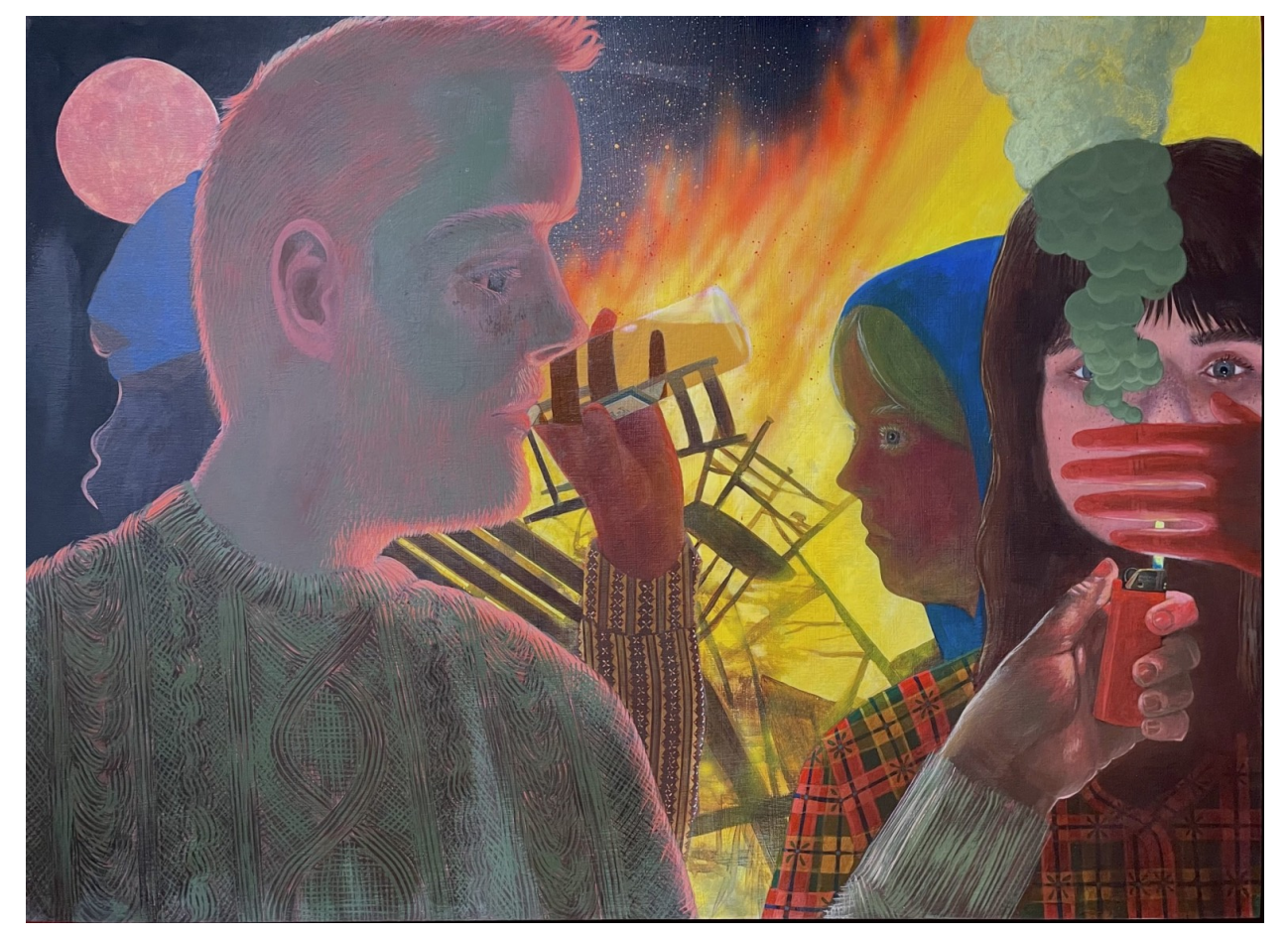
Marcelle Reinecke "Harvest Moon" (2024), acrylic and flashe on panel, 22 x 30 inches

Alexander Gray Associates (alexandergray.com) 224 Main Street, Germantown, New York Through June 16