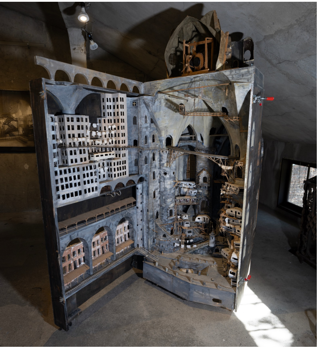
Lothar Osterburg, "Piranesi" (2013), wood, paper, metal, paint, 80 x 36 x 42 inches